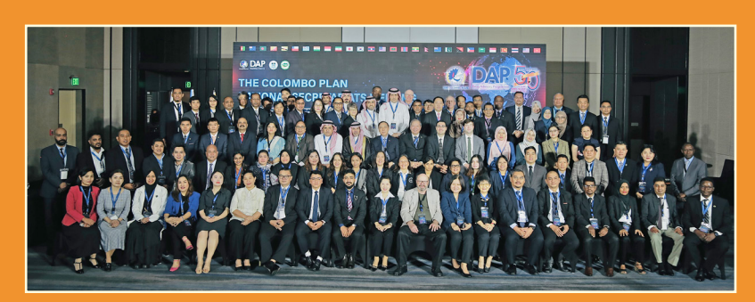
CPDAP National Secretariats Meeting 2023, Manila, Philippines

CPDAP's Universal Recovery Curriculum (URC) equips participants with core competencies and skills to work as recovery support professionals. The URC curricula consists of two stand-alone courses: the Recovery Allies (Allies Link and Lend Inventive Engaging Support) Model and the PEER (Peer Experiences Empower Recovery) Model.